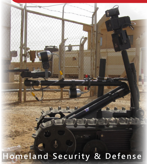
Homeland Security & Defense

Making your job easier from concept → design → manufacturing → integration → production