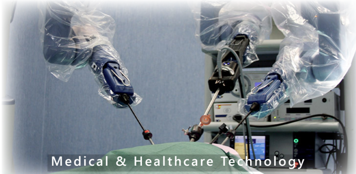
Medical & Healthcare Technology